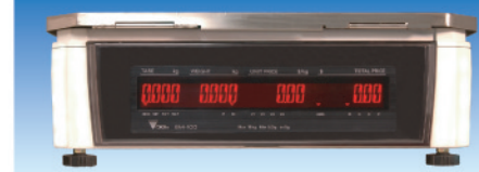
Easy and quick loading of Receipt or Lable